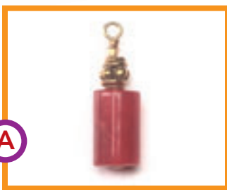
earrings • 1. String a tube, a spacer, and a seed bead on a head pin. Make a wrapped loop (Basic Techniques) above the seed bead.