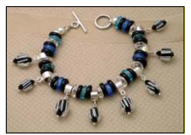
Above: High-tech licorice!

Above: When no matching pairs of cane glass beads were left for earrings, they were transformed into charms. Slipped onto a Spill Proof Bracelet with color glass "doughnut" beads and Bali spacers, these "leftovers" take center stage in an exuberant, bright charm bracelet.