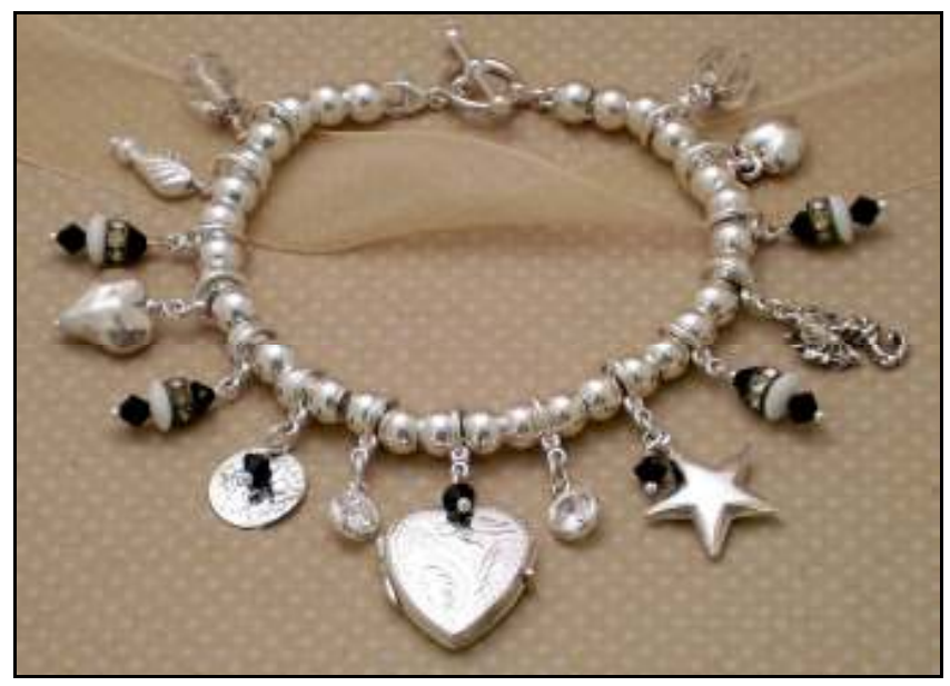
Photo of Project for Beads, Baubles & Jewels (using left over and vintage beads and charms)