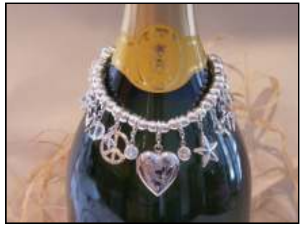
Above: A finished collection of charm featuring a locket from Denise's grandmother.

Examples of the variety of Spill Proof Bracelet, using various beads, charms, slides and findings: