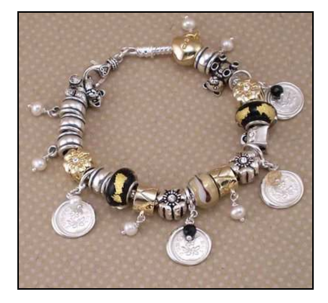
Above : Charms on rings add personalized flair to popular "Euro" bracelets