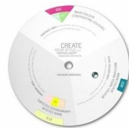
SWAROVSKI ELEMENTS color wheel, www.create-your-style.com .