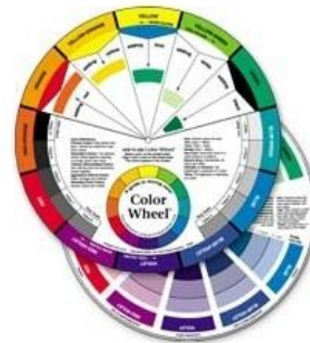
The guide to mixing colors Color Wheel, www.colorwheelco.com .