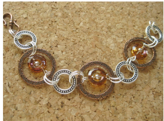
Link solid rings together to make a simple, chic bracelet.

Sources: TierraCast® rings and clasp, www.tierracast.com ; Beadalon® stringing materials, crimps, tools and Artistic Wire, www.beadalon.com ; Bead Gallery bronzite beads, www.halcraftusa.com .