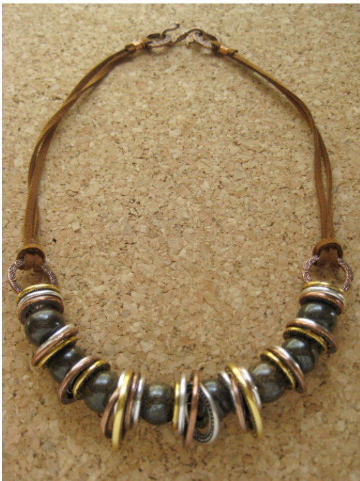
Get a new perspective on rings!

Rings are a common jewelry-making element that can be interpreted in a variety of ways. Take a look at this!