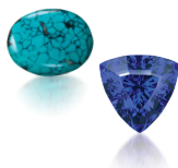
Tanzanite & Turquoise