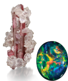
Tourmaline & Opal