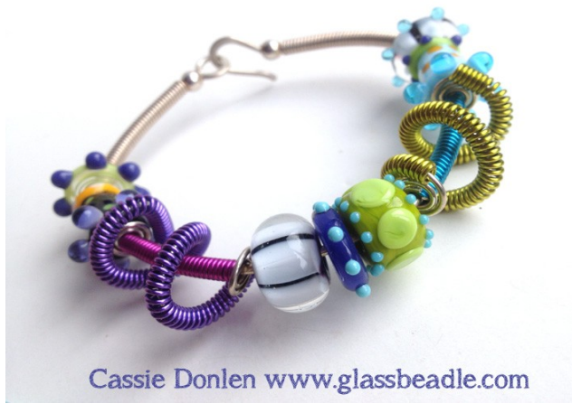
Cassie Donlen www.glassbeadle.com