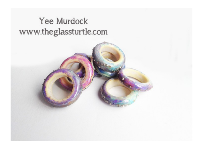
Yee Murdock <u>www.theglassturtle.com</u>