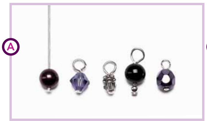
1. String a 6mm accent bead onto a head pin; repeat with the remaining 6mm beads, adding a 2mm spacer bead on one. String a 4mm accent bead and a flat spacer onto a head pin. Trim the head pins to % in. (10mm) above the beads and turn a plain loop (Basic Techniques, p. 108). Set aside.