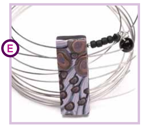
5. String a 2mm bead and ½ in. (13mm) of seed beads, ending with a 4mm accent bead. Turn a plain loop at the end of the memory wire. Open the loop on a dangle, attach it to the memorywire loop, and close the dangle's loop.