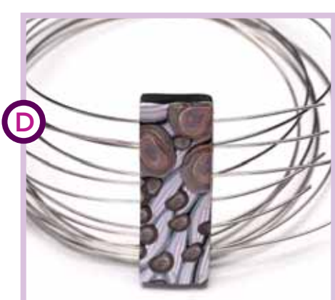
4. String the straightened end of each piece of memory wire through the art bead.