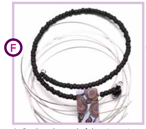
6. On the other end of the wire, string a 2mm bead. String seed beads on the rest of the coil and turn a plain loop at the end. Repeat steps 5 and 6 with the remaining five coils of memory wire, varying the sizes and colors of beads.