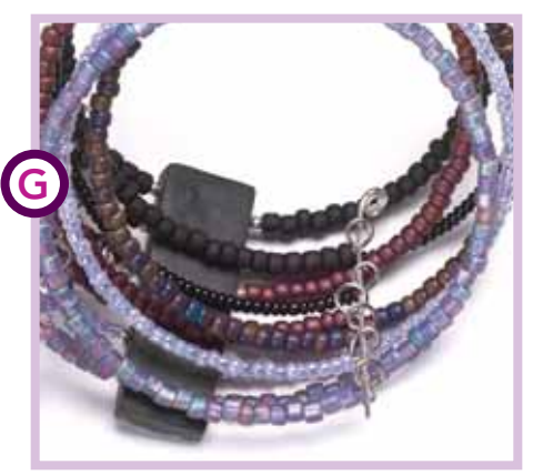
7. Snip the end from a head pin and turn a loop or coil at the end. Slide the pin through the six loops on the bracelet and turn a matching loop at the other end. &