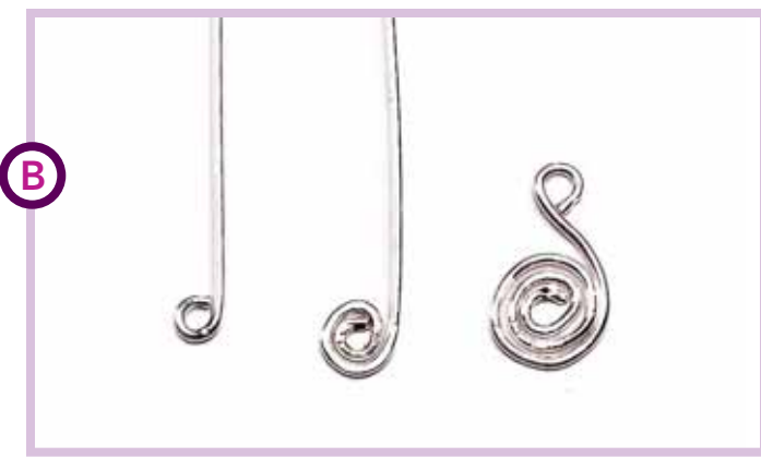
2. To make a sixth dangle out of wire, trim the end off a head pin. Use roundnose and chainnose pliers to turn a spiral design. Make a plain loop above the spiral. Set aside.