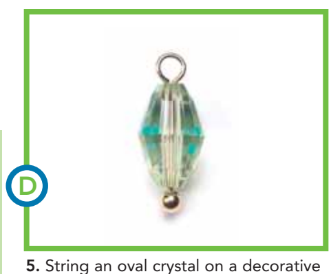
5. String an oval crystal on a decorative head pin. Make a plain loop (Basic Techniques) above the crystal. Make four more dangles with bicone crystals.