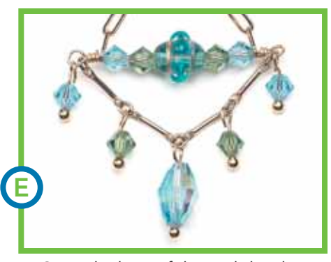
6. Open the loop of the oval dangle and attach it to the center link on the lower chain. Close the loop. Attach the remaining bicone dangles to the lower chain, alternating colors.