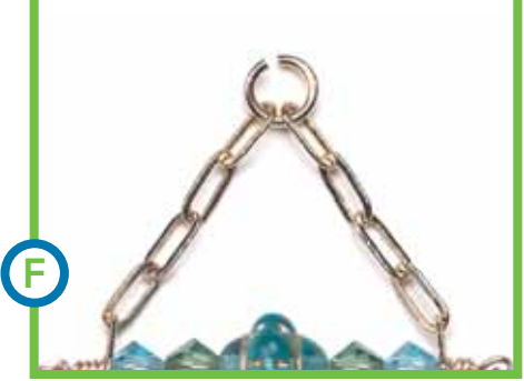
7. Open a jump ring (Basic Techniques) and string each end link of the upper chain. Close the jump ring.