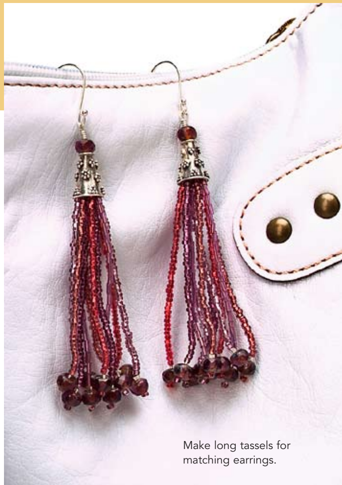
Make long tassels for matching earrings.