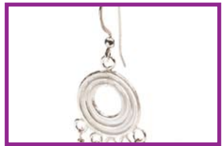
Open the loop of an earring wire (Basics). Attach the dangle and close the loop. Make a second earring to match the first. &