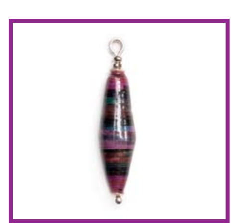
earrings • On a decorative head pin, string a long paper bead and two cylinder beads or Charlottes. Make a plain loop (Basics, p. 112). Make four short-bead units.