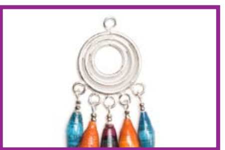
Open the loop of the long-bead unit (Basics) and attach the center loop of a chandelier finding. Close the loop. Attach the remaining bead units.