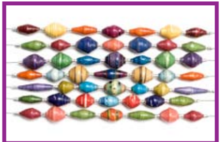
String the pattern in steps 1 and 2 on the remaining wires, balancing different colors and shapes.